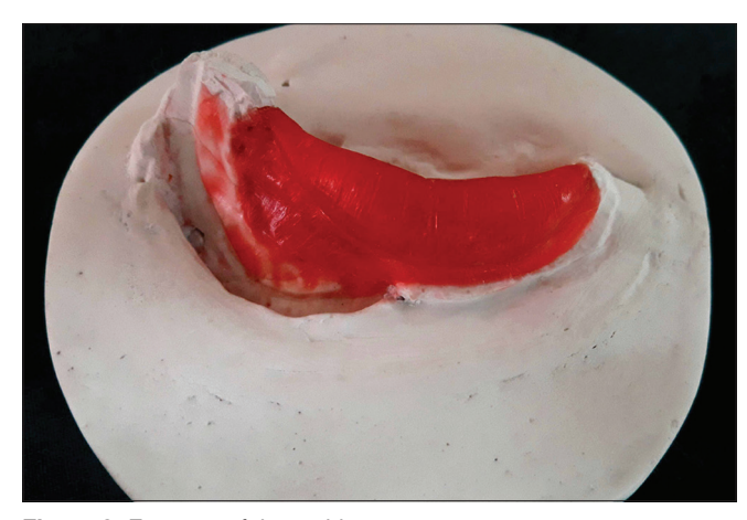
Figure 6: First part of the mold

Lip is a tactile organ which contributes not only to the process of articulation but also in creating oral seal. Its importance in attractiveness, identification of an individual,