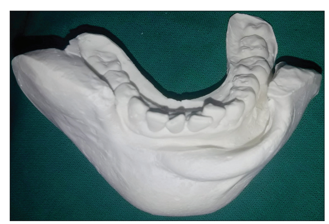
Figure 4: Model of lip defect