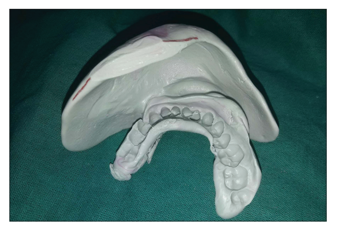
Figure 3: Combined intra- and extraoral secondary impression