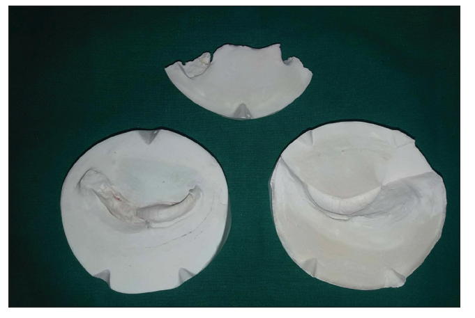
Figure 7: Three-piece mold

matched silicone (Technovent M511; Technovent Ltd.) was placed on to the different parts of the mold after applying a silicone-releasing agent (Orthokal, Kalabhai, Mumbai, Maharashtra, India) and polymerized as per instructions. Prosthesis was removed from investment [Figure 8] and finished and extrinsic staining was done, where required. Prosthesis was delivered to the patient 18 months back [Figure 9], who was satisfied by improved esthetics, lessened drooling, and enhanced speech intelligibility and retention, as recorded on the 3-monthly recall appointments. However, interruption of seal between prosthesis and movable soft tissues of the lip and cheek, sometimes resulted in margin show-through. Furthermore, extension of the prosthesis over the entire lip slightly increased the contour of the remaining natural portion of the lower lip.