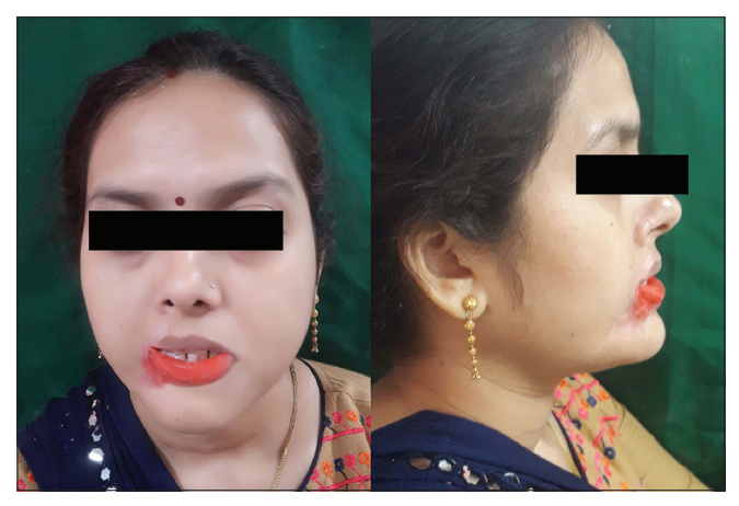
Figure 5: Pattern: frontal and profile views

The wax pattern was modified to develop profile, shape and merge margins of prosthesis with natural tissue, and imitate wrinkles, skin creases, etc. [Figure 5]. To further improve the adaptation and retention, a wash impression was made in light body addition silicone (Elite HD; Zhermack, Badia Palesine, Italy) on the wax pattern itself. This relined wax pattern was again poured in white die stone (Orthokal, Kalabhai, Mumbai, Maharashtra, India) followed by marginal sealing, thinning, and merging with adjacent tissues [Figure 6]. This pour formed the first part of the mold into which keys were made for indexing. A three-part mold was necessary to achieve better characterization of different lip parts and removal of prosthesis without tearing. The second and third pours were preceded by careful application of separating media. For second pour, the boxed 1st part of mold was poured up to the inner lip line; keys were again made in this pour, followed by the third pour which was made to cover both previous pours. Dewaxing was carried out at 100°C for 5 min. The mold was cleaned properly [Figure 7]. Shade matching was done with the help of a digital spectrophotometer (Orthokal, Kalabhai, Mumbai, Maharashtra, India), and an appropriately colored