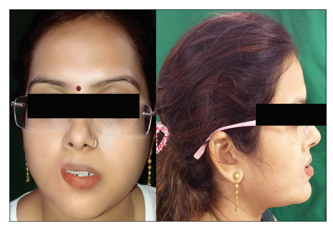
Figure 9: Final prosthesis after extrinsic coloring: frontal and profile views

and communication is undeniable. Any lip deficiency naturally leads to speech impairment and drooling of food and saliva.<sup>[6]</sup> The prominent location makes it impossible to be missed by the eye. Therefore, a meticulous and swift correction of the defect is imperative to the patient's psychological well-being.