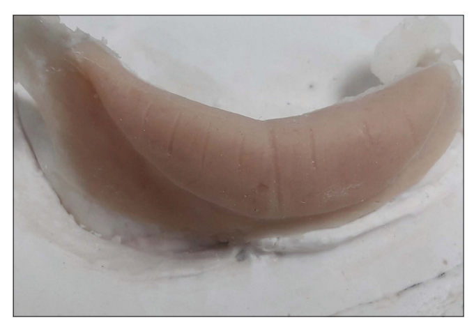
Figure 8: Retrieved prosthesis from the mold